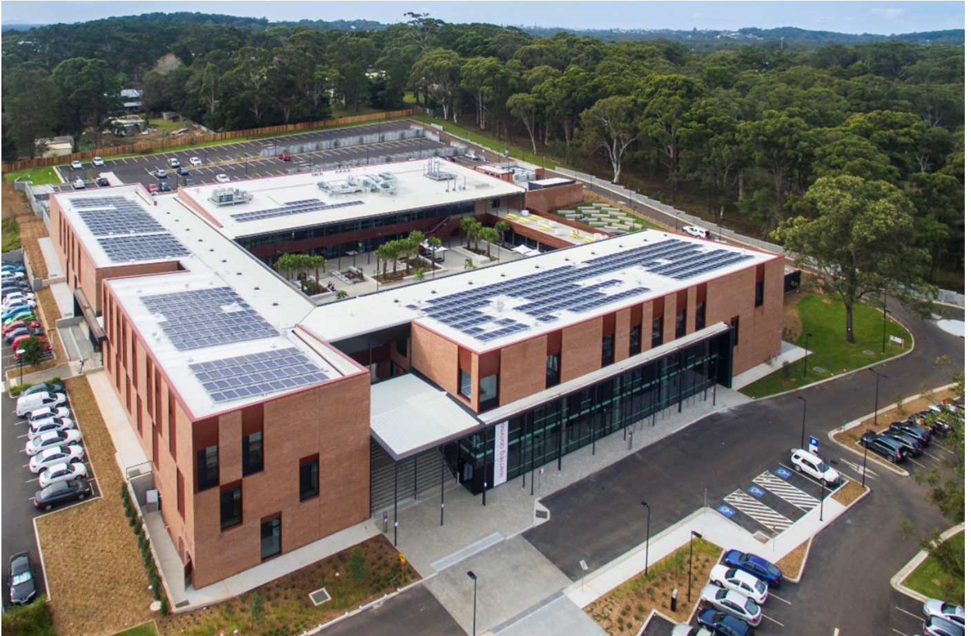
Charles Sturt University Library.