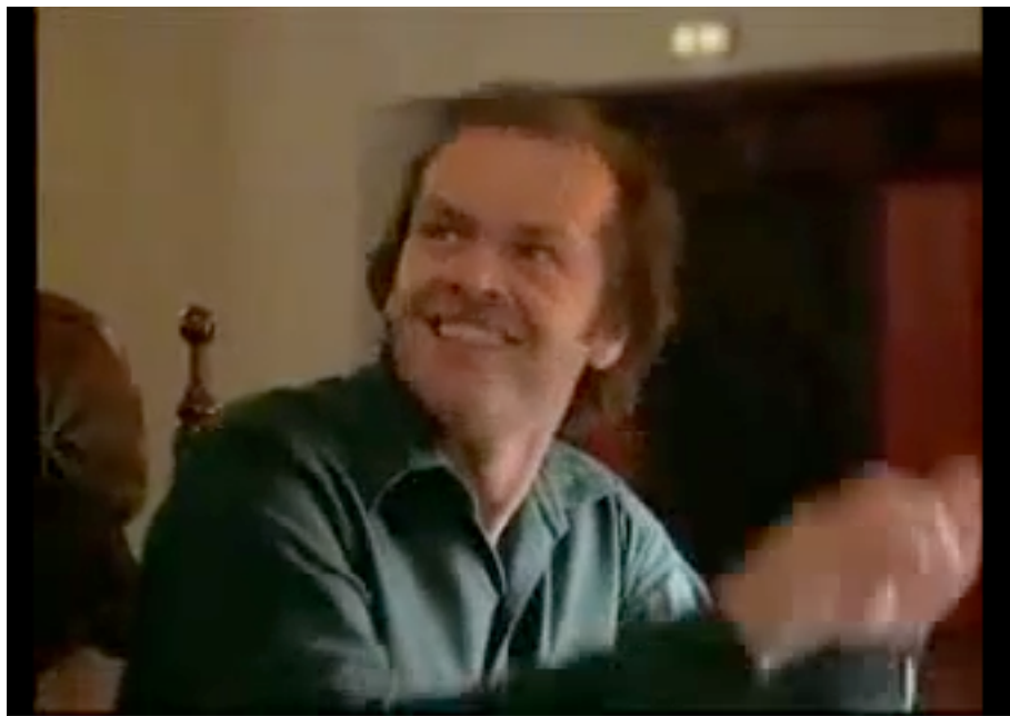
The Shining Trailer Mash-up