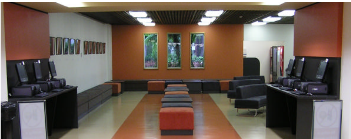
Curtin's lounge @ your library

Future plans for the Library include providing an integrated service desk, comfortable time-out spaces for quiet work, more silent study areas and a wired laptop area. The challenge ahead is nicely illustrated by the following student feedback - ‘the facilities in the lounge are excellent, but we need more of them!’.