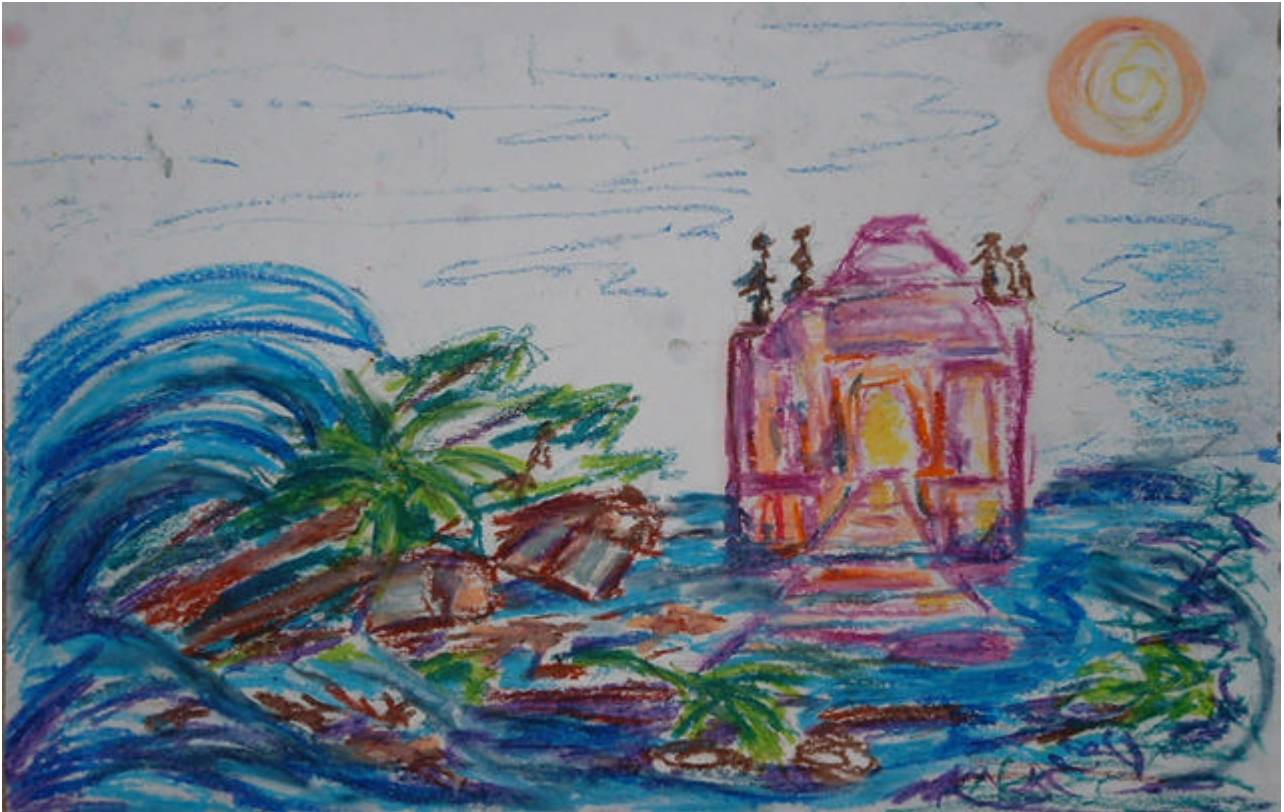
First Image - . Was the image I completed when I first arrived back. Title "Refuge "