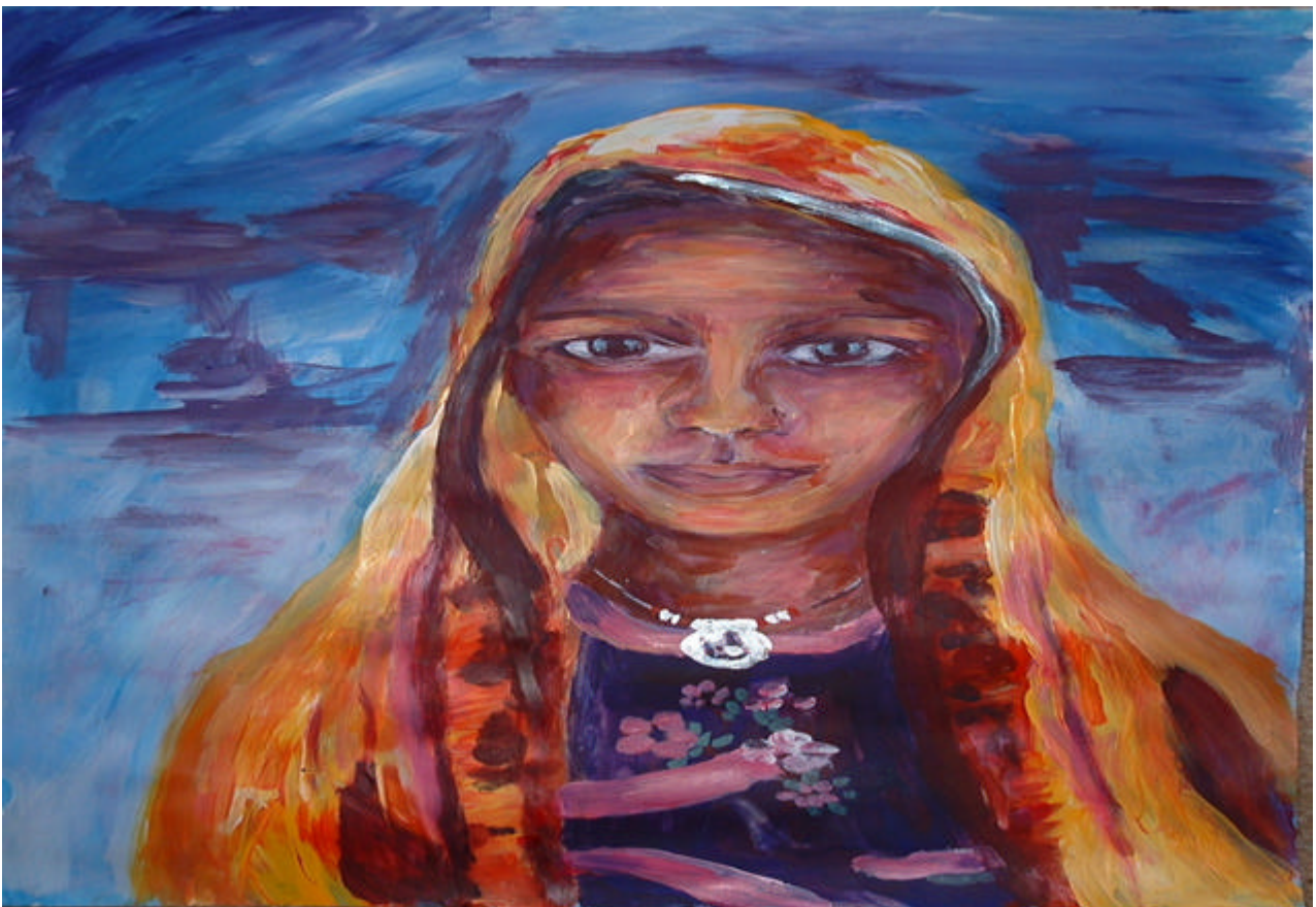
Second Image – Completed after being back five months. Title "Emerging"