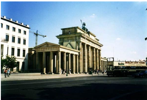
The Brandenburg Gate