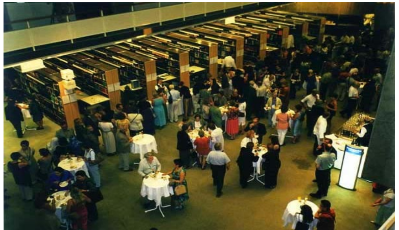
The Stasbibliotech in Berlin