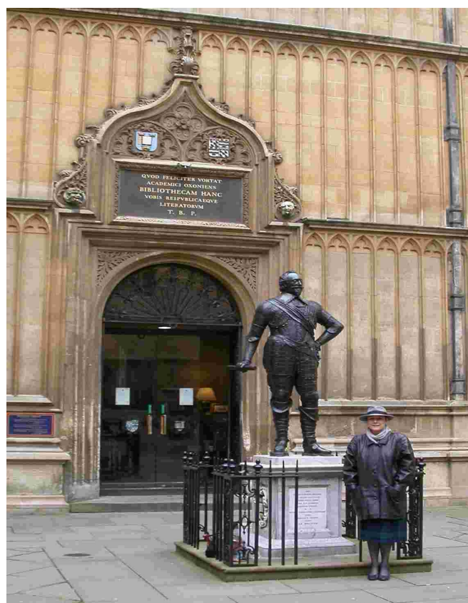
Bodleian entrance to main reading rooms