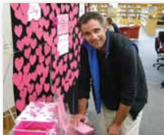
A would-be winner

Glenorchy Library & Online Access Centre celebrated Library Lovers Day 2009 for a week. Our focus was on the love of reading, and we also wanted to make maximum impact using minimum resources.